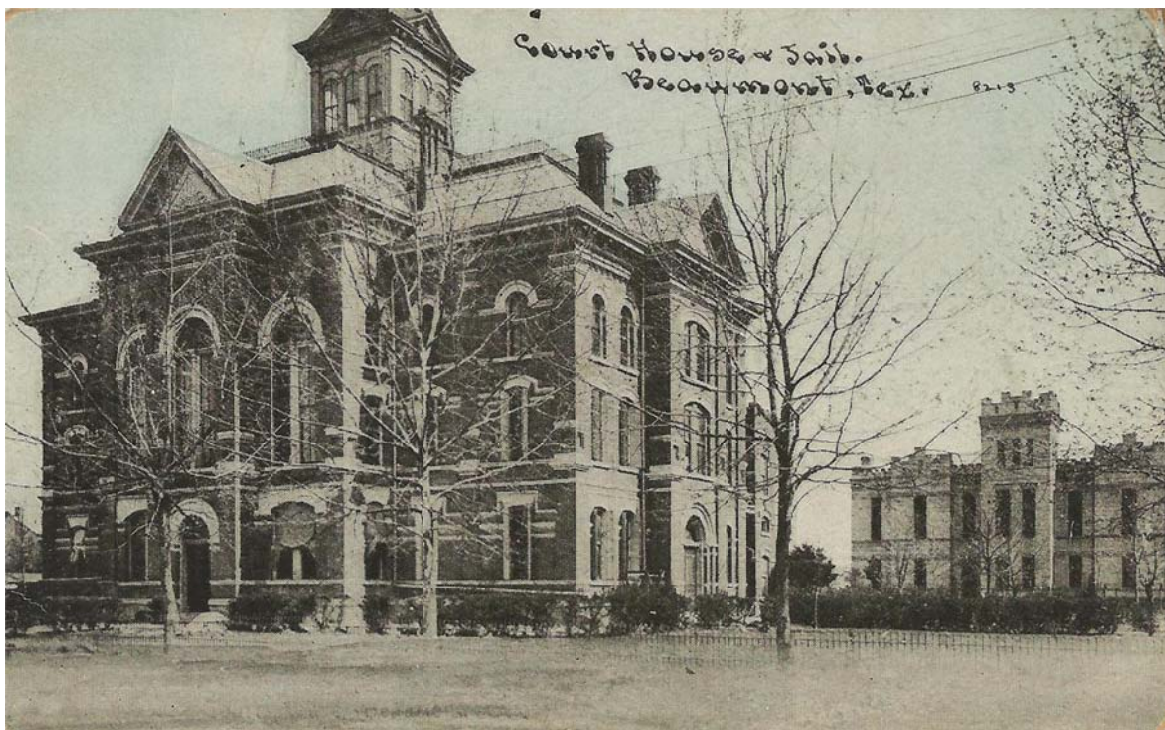
Photograph of Jefferson County Courthouse built in 1893 and Jail