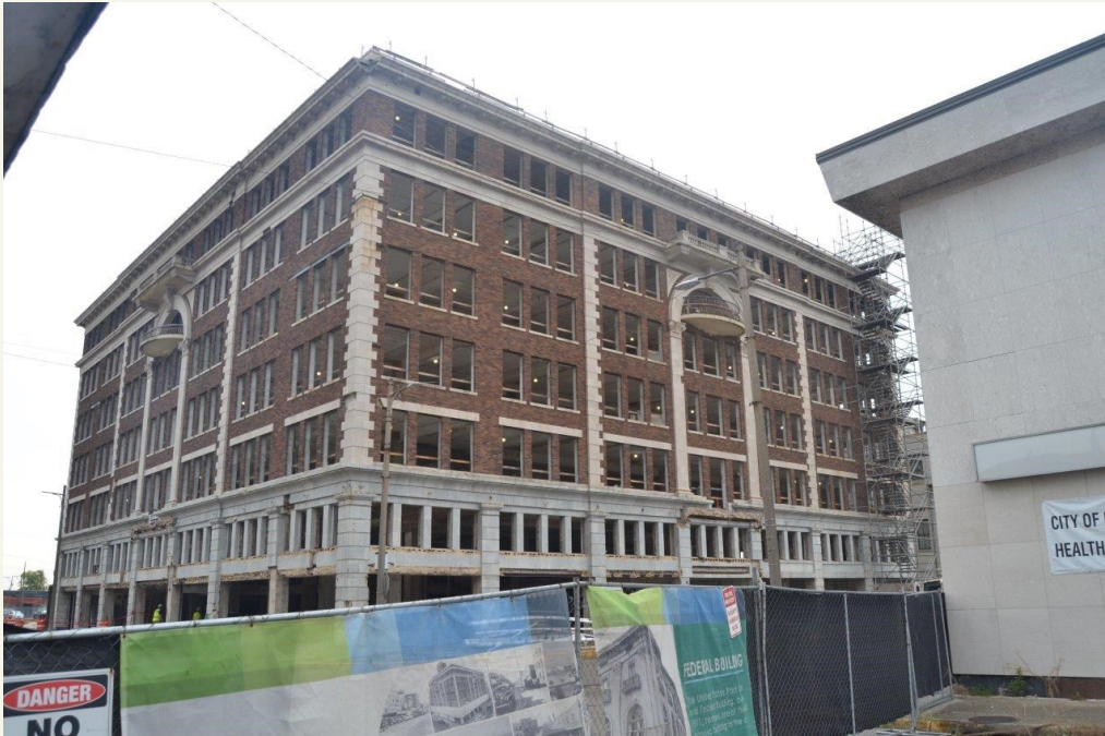
Photo of Adams Building as of August 28, 2024 as it undergoes renovation by Motiva.