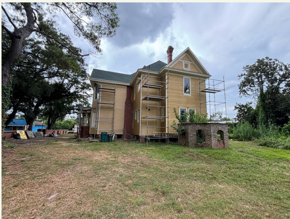
Photos of the Hinchee House from August 27, 2024 as exterior painting is completed.