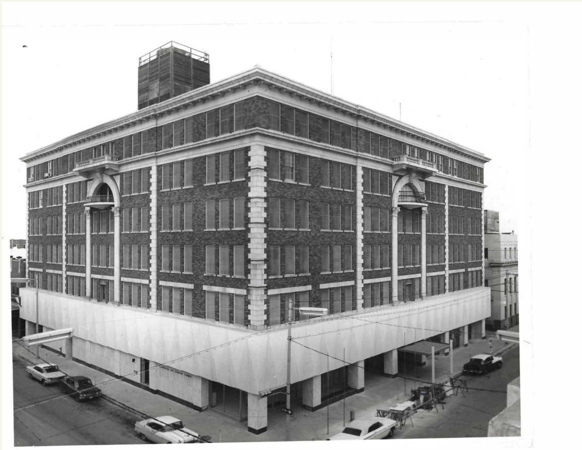
John R. Adams building c. 1960s with modern updates to the exterior.