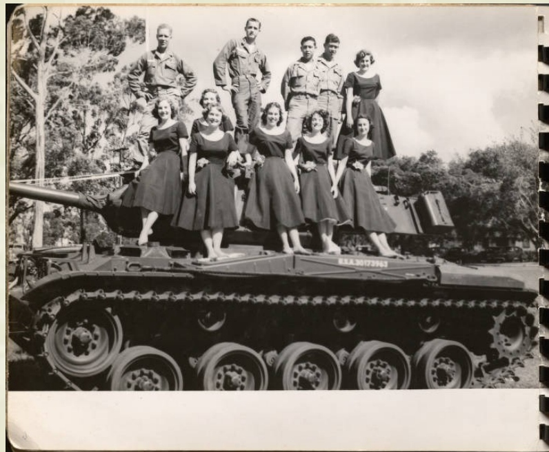
A photo of some of the Melody Maids in Hawaii in 1954 with American servicemen. (Continued on page 2)