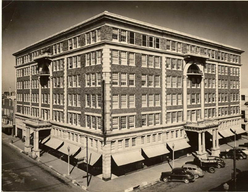
John R. Adams building C. 1940s.