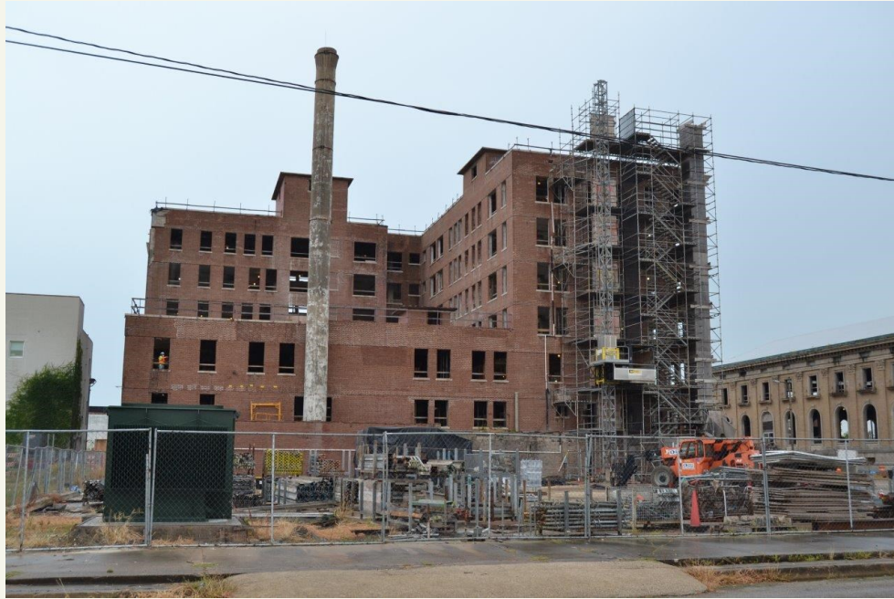
Photo of Adams Building as of August 28, 2024, as it undergoes renovation by Motiva.