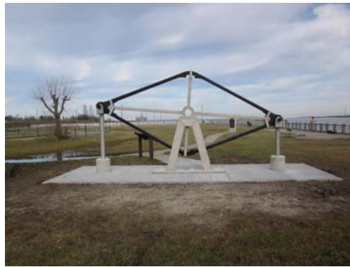
Photos of Restored “Walking Beam” from USS Clifton installed at Sabine Pass Battleground