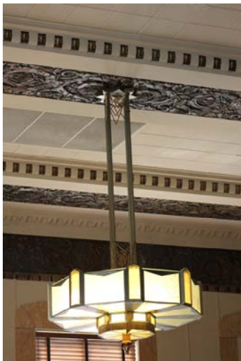
317th District Courtroom Light Fixture Jefferson County Courthouse

We're on the web! http://co.jefferson.tx.us/