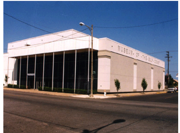
Museum of the Gulf Coast