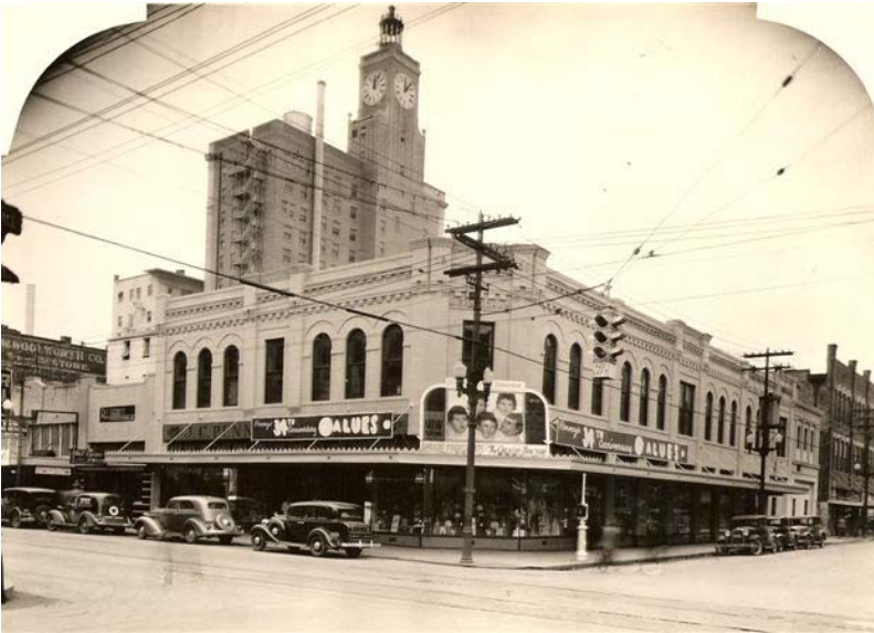
Historic Downtown Beaumont in 1930's

Beaumont Main Street has launched a new advertising campaign of public service announcements to bring attention to downtown Beaumont. Their website has a wonderful walking tour guide to historic downtown. The guide can be accessed at: