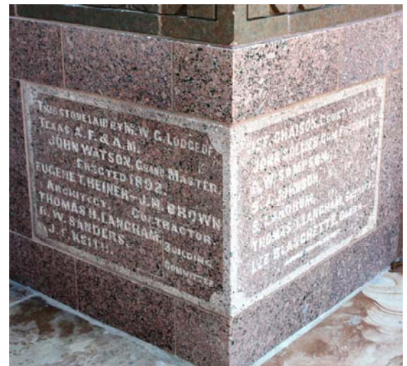
Jefferson County Courthouse Cornerstone

There remains some 75 historic courthouses in need of repair and restoration. This fact was recognized by the Historic Trust this past year when Texas Courthouses were listed, for the second time, on their list of the 11 most endangered historic places in the nation.