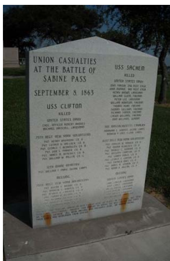
Sabin Pass Battleground Union Casualties Commemorative Marker

We're on the web! http://co.jefferson.tx.us/