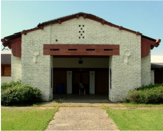
Tyrrell Park Community Building