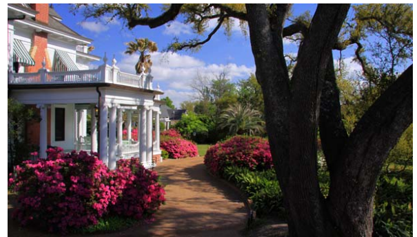
McFaddin Ward House