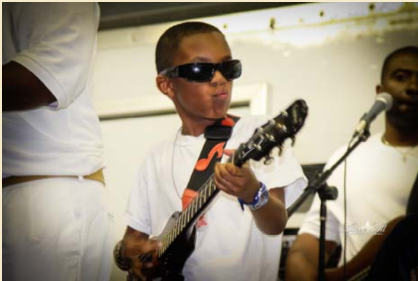
City of Beaumont Juneteenth Celebration in Tyrrell Park

Visit the Library of Congress for first person stories of former slaves in Southeast Texas: