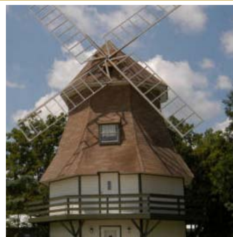
Dutch Windmill Museum