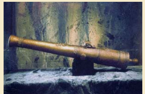
Images of the cofferdam built for the excavation of the ship La Belle in Matagorda Bay, Texas, and the first of 3 bronze 4-pounder cannons discovered in the hold of the ship.