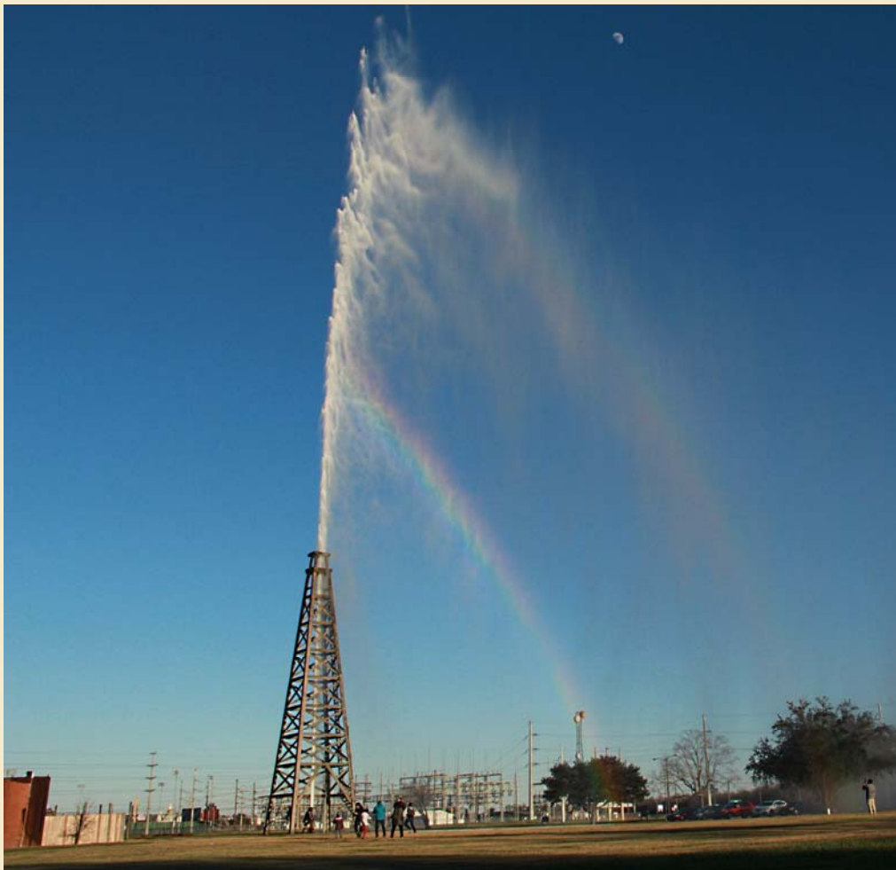
Replica Spindletop Gusher Blows