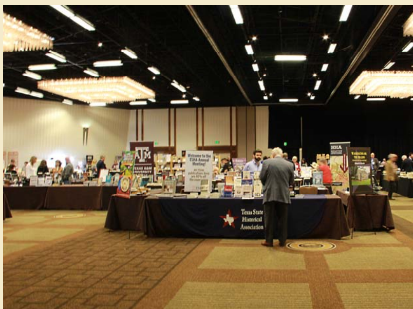
Texas State Historical Association Conference