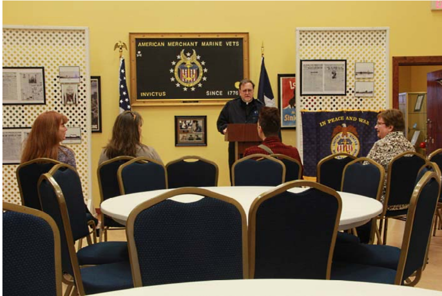
WWII Memorial at Seaman's Center in Port Arthur

The Port Arthur International Seafarers' Center and the Apostleship of the Sea – Diocese of Beaumont have held memorial observances for vessels and crews lost to German U-Boats en route or sailing from Southeast during the months of January and February 1942.