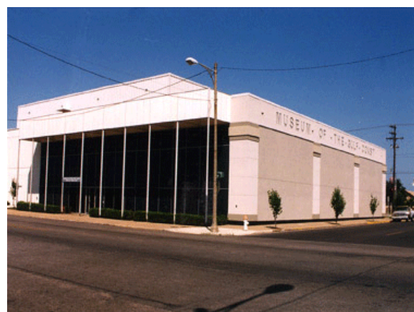
Museum of the Gulf Coast