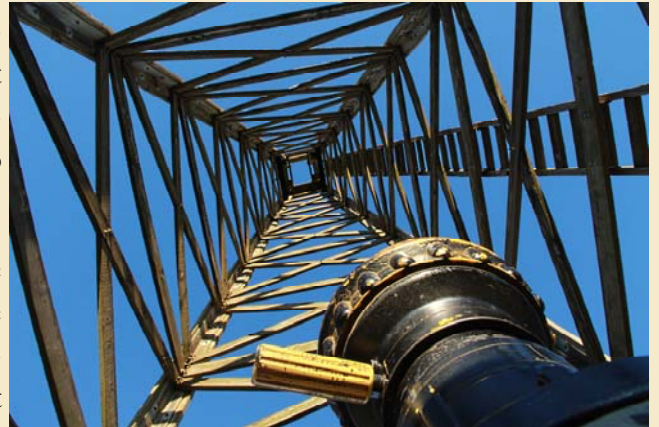
Spindletop-Gladys City Replica Oil Rig

The event included setting off the Spindletop replica “gusher”, a sight which always delights visitors.