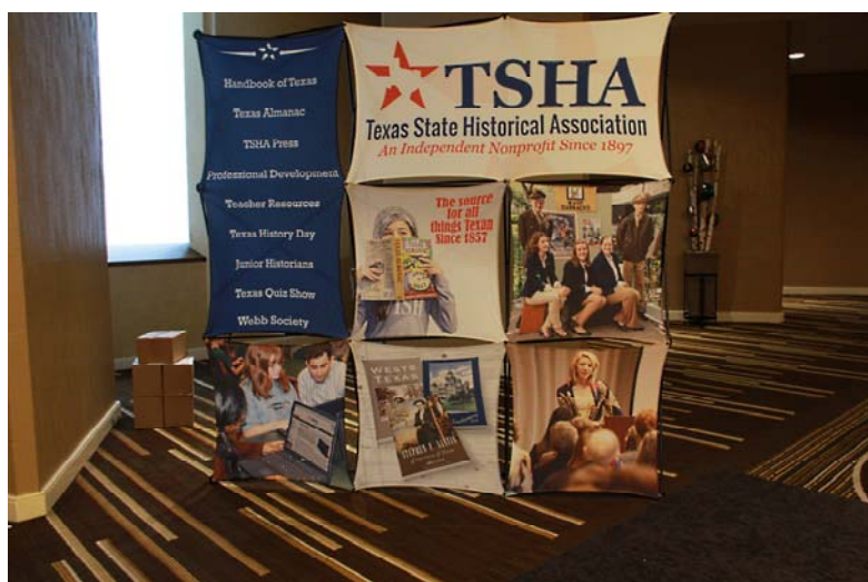
Texas State Historical Association Conference Display