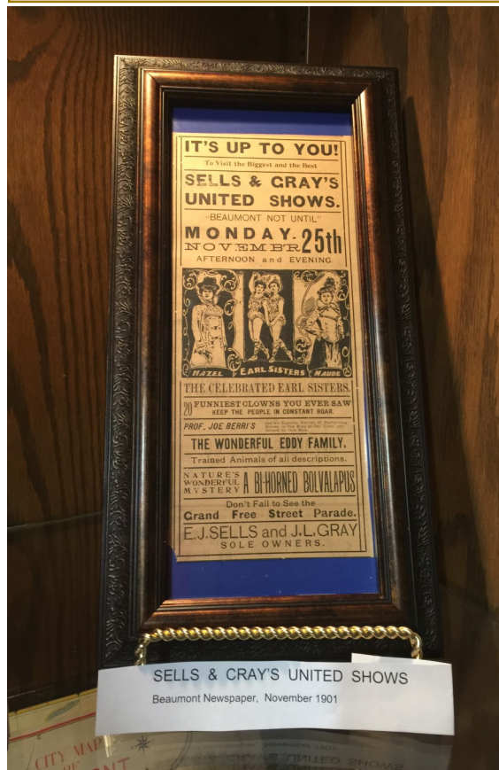
Flyer advertising Sells & Cray's United Shows, 1901