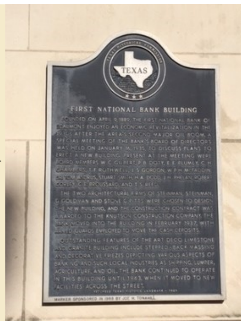
First National Bank Building Historical Marker in downtown Beaumont

The second training will be conducted on August 15, 2019, at 2:00 p.m. This free webinar will walk through a sample historical marker application, line by line, and cover the 2020 work plan for the upcoming marker round. A workshop to view this training will be held in the Jefferson County Historical Commission's conference room on the third floor of the courthouse on August 15, 2019, at 2:00 p.m. - 3:30 p.m. The training is open to the public.