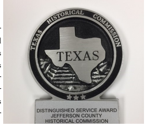
2018 Distinguished Service Award

Congratulations to our JCHC members for earning our 37th Distinguished Service Award from the Texas Historical Commission! This award is presented in recognition of JCHC's dedication to historical preservation. Our members contributed over 3100 volunteer hours in 2018, working on many projects including our first ever historical calendar published for 2019.