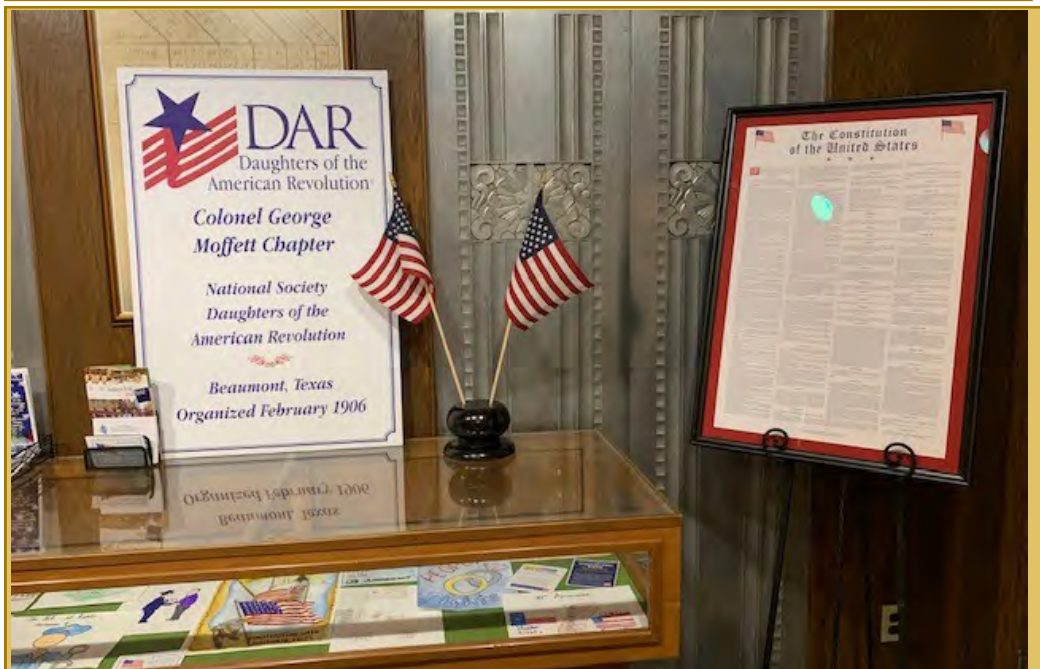
“Constitution Week” DAR Exhibit

The Daughters of the American Revolution (DAR) Beaumont Chapter is sponsoring an exhibit in the Courthouse mini-museum during the month of September in honor of Constitution Week to be celebrated September 17 – 23, 2019.