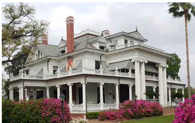
McFaddin-Ward House Museum

Bring your entire family and some friends. Bring picnic supplies, food, ice chests, and cold beverages. It's the best way to pass a great time. See you there! Credit: McFaddin-Ward House Museum