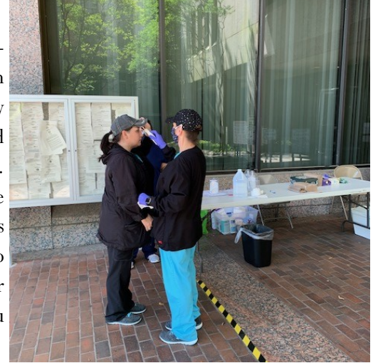
Nurses from Jefferson County Employee Health Department screen the public for COVID-19 fever symptoms at the Jefferson County Courthouse on April 1, 2020