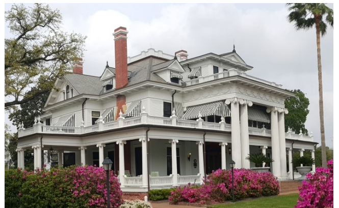
McFaddin-Ward House Museum