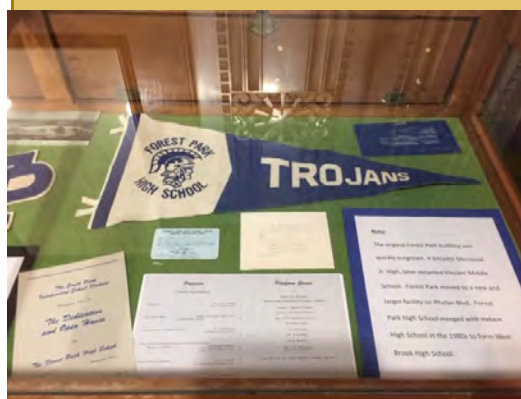
Forest Park High School Memorabilia Exhibit in Courthouse Mini-museum