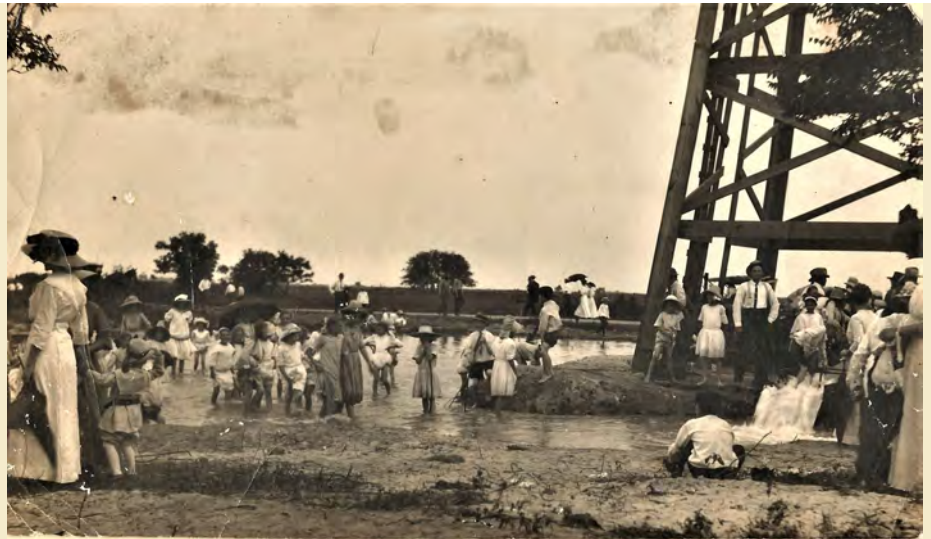
Artesian Well- Port Neches Park

Many years ago, I came across some information that Port Arthur, in its early years, had its fresh water supplied by the Port Arthur Water Company from an artesian well in part of what is now Port Neches Park. A 210-acre tract on which the well was located was owned by the Port Arthur Water Company, then by the City of Port Arthur. At least two pictures, one of which is in the JCHC 2021 calendar, have circulated for years. (See photo to the right)