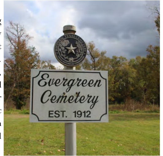
Evergreen Cemetery, Historic Texas Cemetery Marker