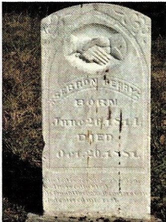
Headstone of Seaborn Berry, who died in 1881, a lone gravesite located on a tank farm at Port Neches

We're on the web! http://co.jefferson.tx.us/ Historical_Commission/