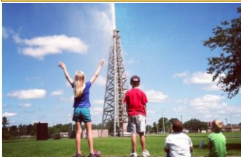
Spindletop Gladys City Gusher Re-enactment