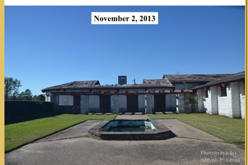
CCC Community Building at Tyrrell Park in 2013

The original buildings at Tyrrell Park were built by the Civilian Conservation Corps in the middle 1930s. The largest of the surviving structures is referred to as the Recreation or Community Building. The city had allowed this important building to fall in disrepair and was in danger of having its roof removed and used as an open-air pavilion. The Beaumont city council decided that it was worth saving and $2.1 million were earmarked for the project. The plan was to restore the structure to its former appearance with a few modifications. In August 2020, a project to renovate it began with the goal being for it to be used as a nature center. Most of the work has been completed, but the building is far from ready for its intended purpose. While the exterior work is complete, the building is empty since the proposed exhibits have not been built.