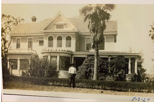
Photograph of Caroline Gilbert Hinchee House on September 3, 1924