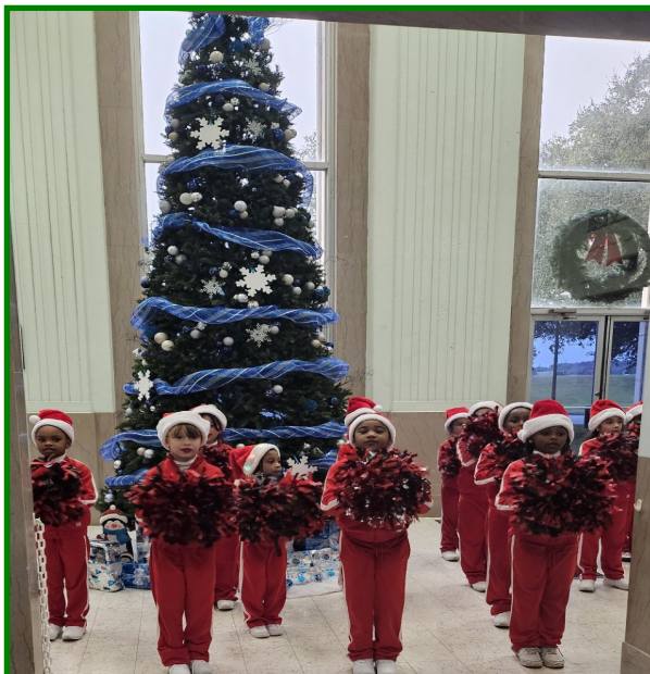
Pictured left: Students from Booker T. Washington Elementary school in front of the Sub-Courthouse Christmas Tree.

Employee Assistance Program 1-800-324-4327