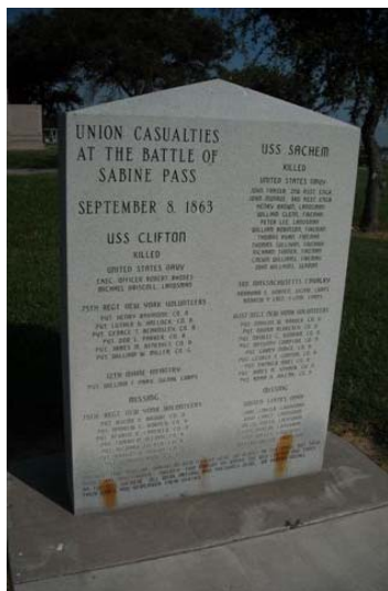
Sabin Pass Battleground Union Casualties Commemorative Marker

We're on the web! http://co.jefferson.tx.us/