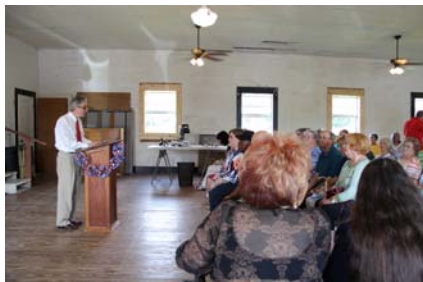
Hardin County Museum Grand Opening