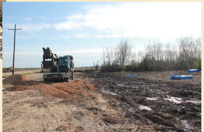
Recent Lincoln Cemetery photos