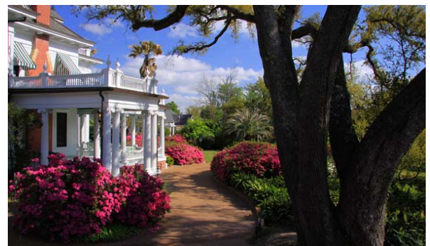
McFaddin Ward House