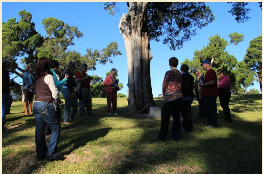
Magnolia Cemetery Tour

Many thanks to Paul and Jimmy for the tour and the informative program.