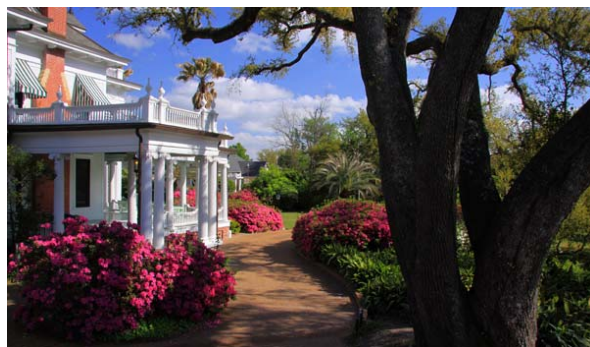
McFaddin Ward House