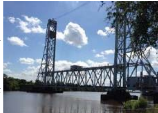
Neches River Lift Bridge Photo Credit: TxDOT Neches River Bridge Study Brochure