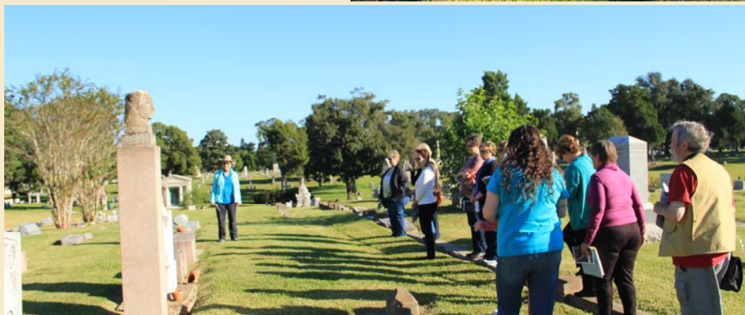
Magnolia Cemetery Tour