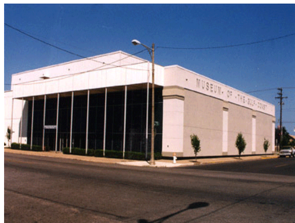
Museum of the Gulf Coast