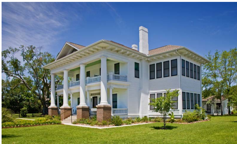
Chambers House