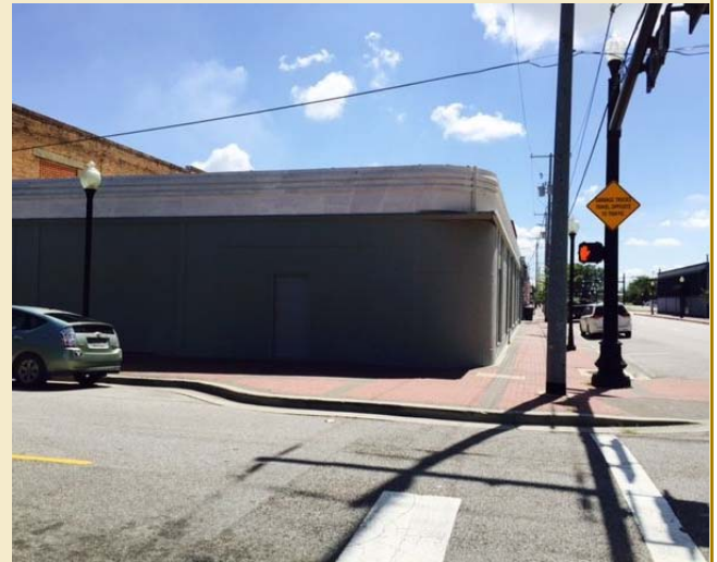
Fertitta Building, corner of Park and Fannin Streets in downtown Beaumont after improvements