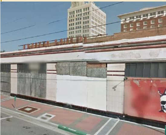
Fertitta Building, corner of Park and Fannin Streets in downtown Beaumont prior to improvements