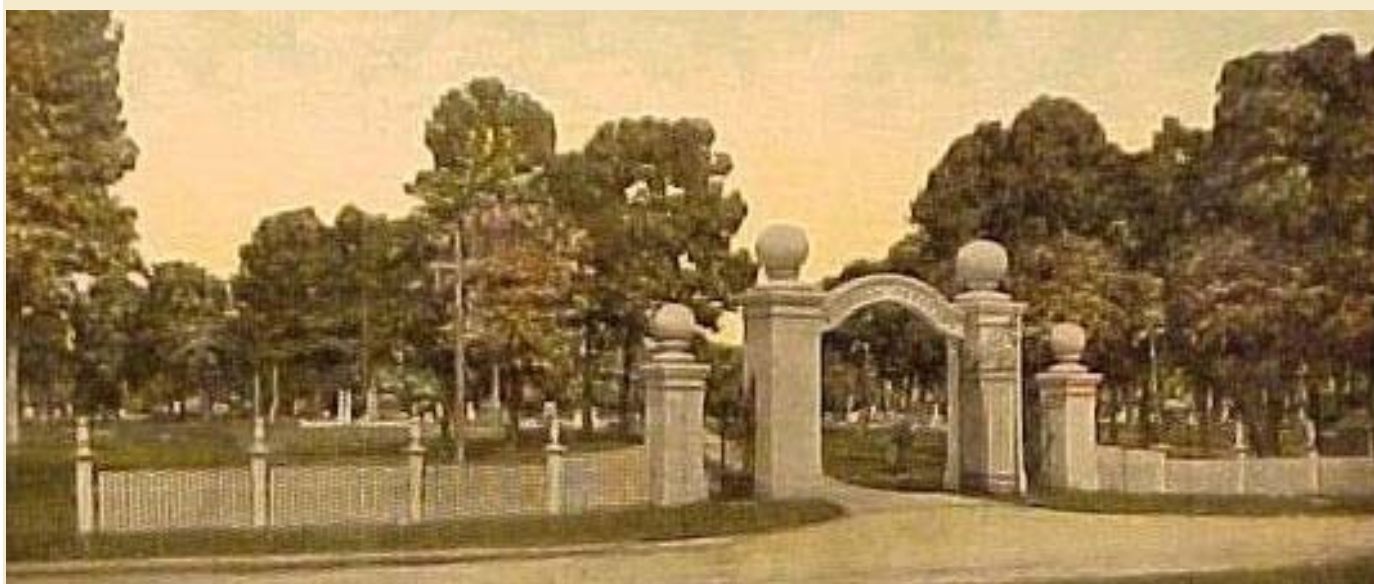
Magnolia Cemetery Postcard