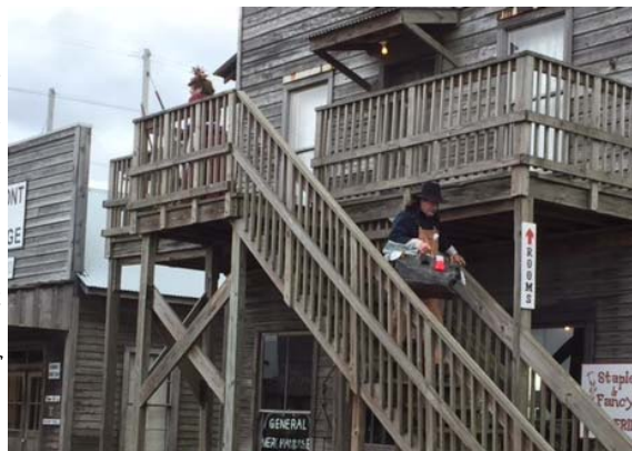
Big Thicket Outlaws Re-enactment at Gladys City Boomtown Museum

Thank you to our members for your time and service in preserving our history.