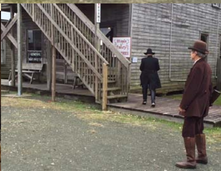
Gusher Re-enactment