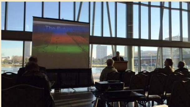
Beaumont Main Street 2016 Annual Meeting