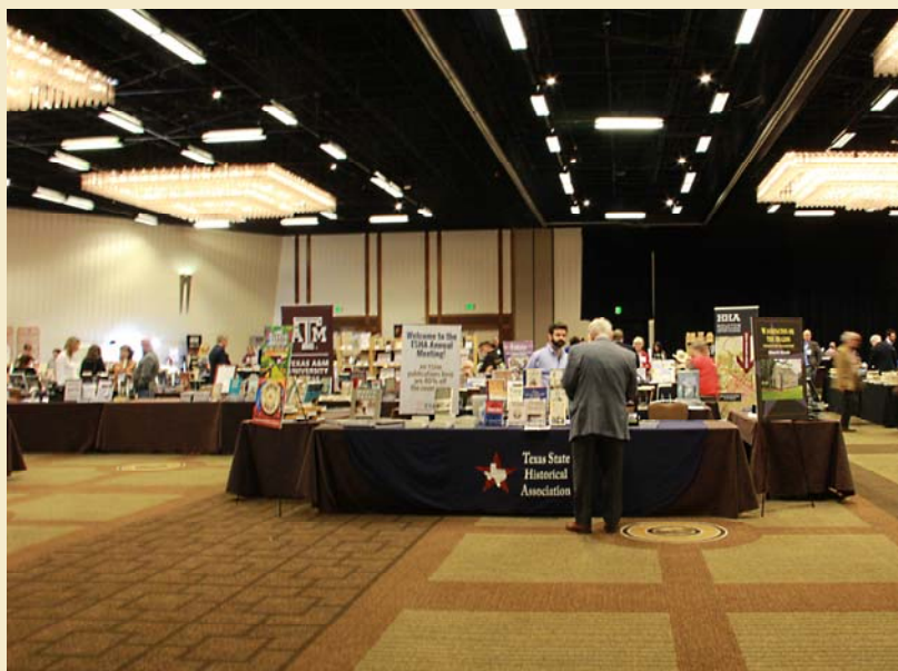
Texas State Historical Association Conference