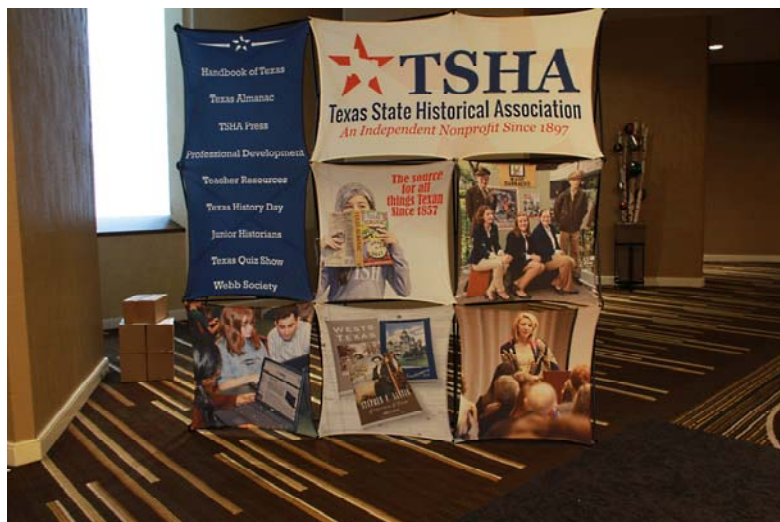
Texas State Historical Association Conference Display