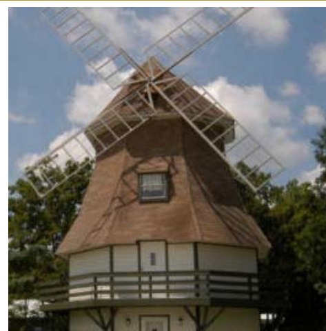
Dutch Windmill Museum