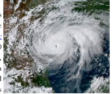
Hurricane Harvey Satellite Image