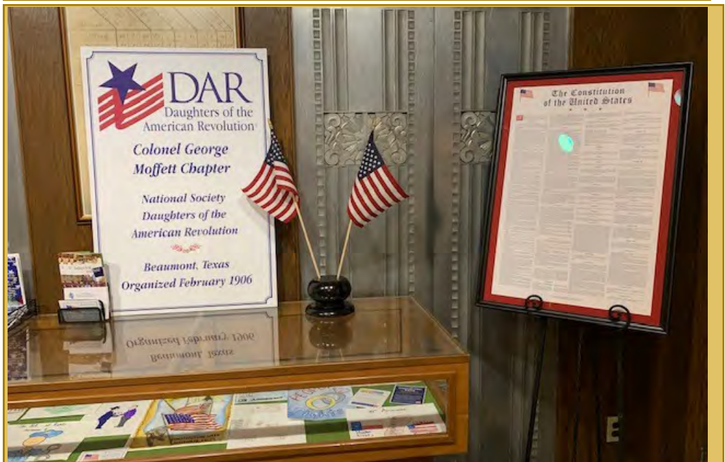
“Constitution Week” DAR Exhibit

The Daughters of the American Revolution (DAR) Beaumont Chapter is sponsoring an exhibit in the Courthouse mini-museum during the month of September in honor of Constitution Week to be celebrated September 17 – 23, 2019.