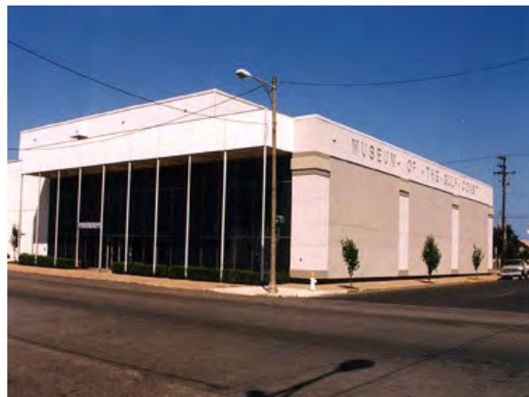
Museum of the Gulf Coast