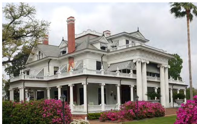
McFaddin-Ward House Museum

Bring your entire family and some friends. Bring picnic supplies, food, ice chests, and cold beverages. It's the best way to pass a great time. See you there!