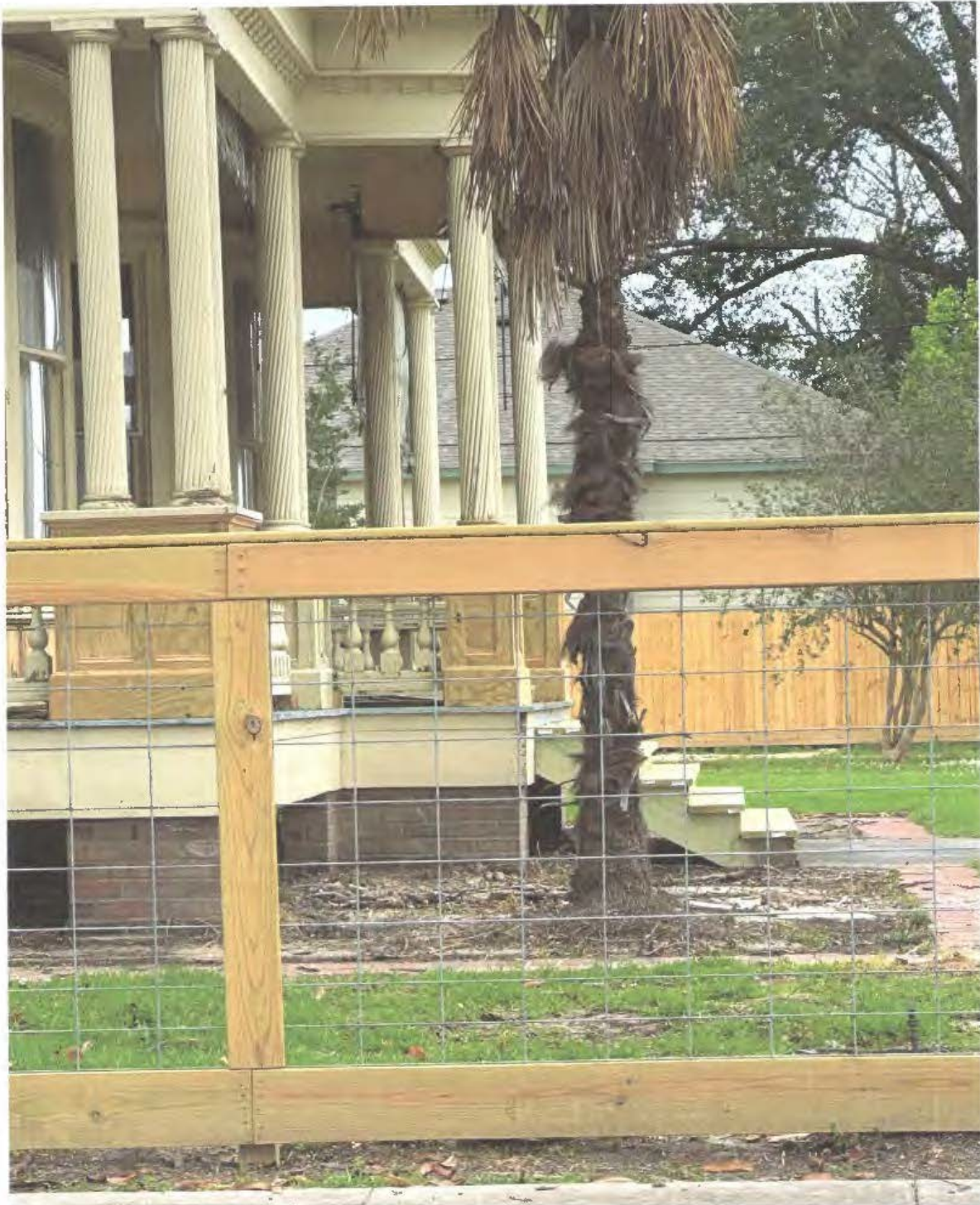
Holmes Duke House