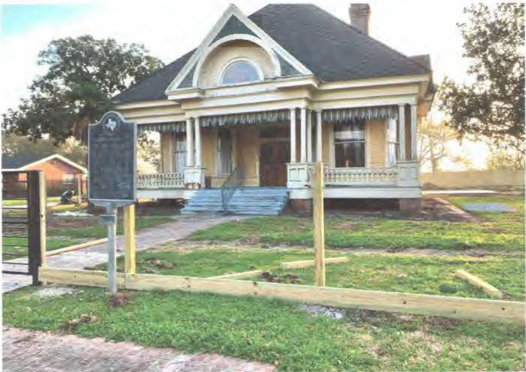
Holmes-Duke House, Feb. 2023