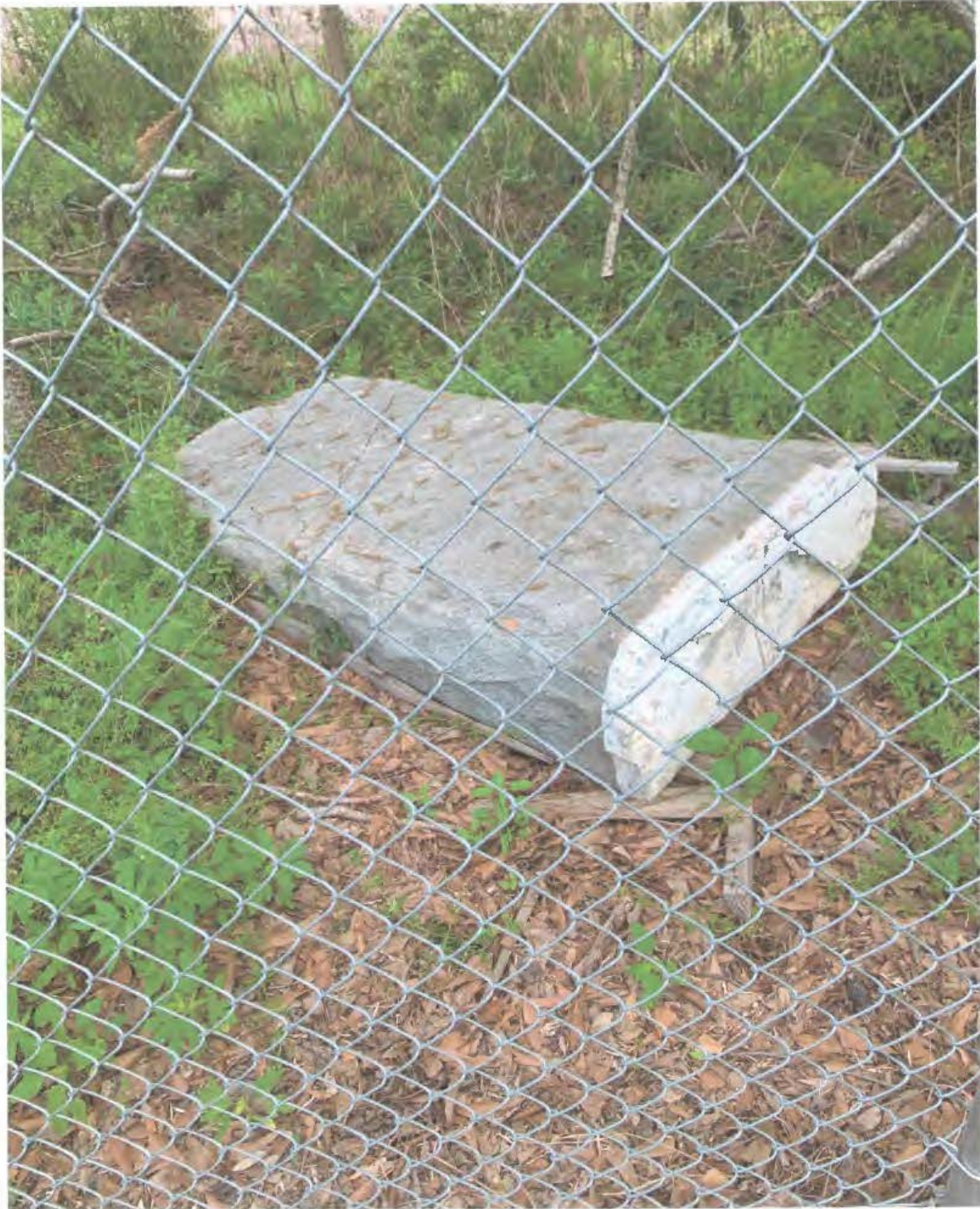
Spillertop, Confederate Camp Site of (March 2023)