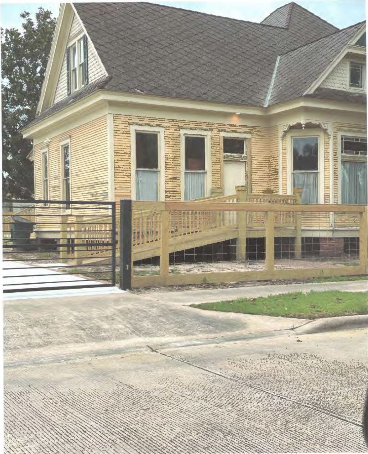
Holmes Duke House (note 2nd Staircase behind garbage can)