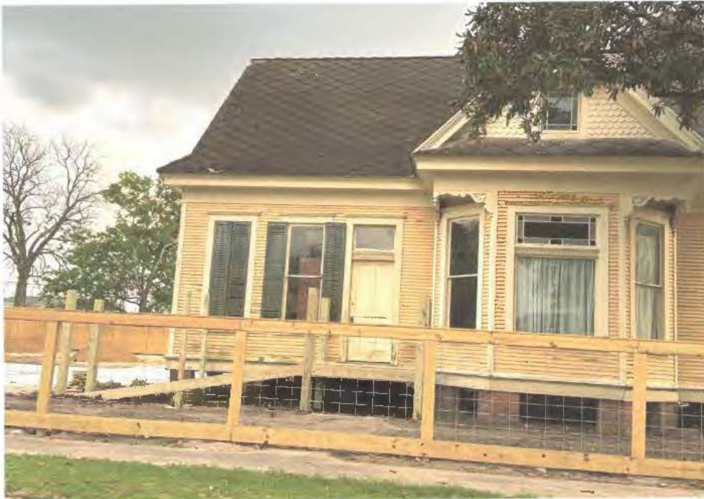
Holmes - Duke House