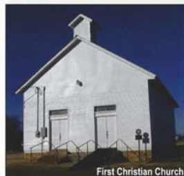
First Christian Church

*Rio Roca Chapel on the Brazos will be open from 10 AM to 2 PM ONLY