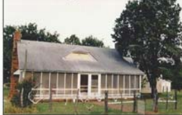
Johnson League Ranch

A Self-Paced Historical & Wildflower Driving Tour