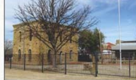
Old Jail Museum

A Self-Paced Historical & Wildflower Driving Tour