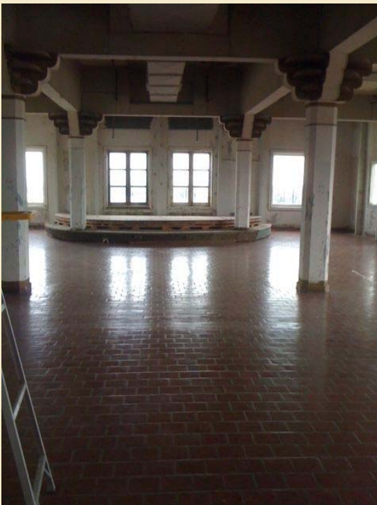
Hotel Beaumont Ballroom