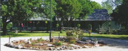
Old Belding Ranch House

*Rio Roca Chapel on the Brazos will be open from 10 AM to 2 PM ONLY