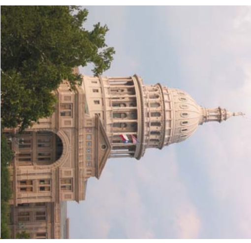
Texas State Capitol