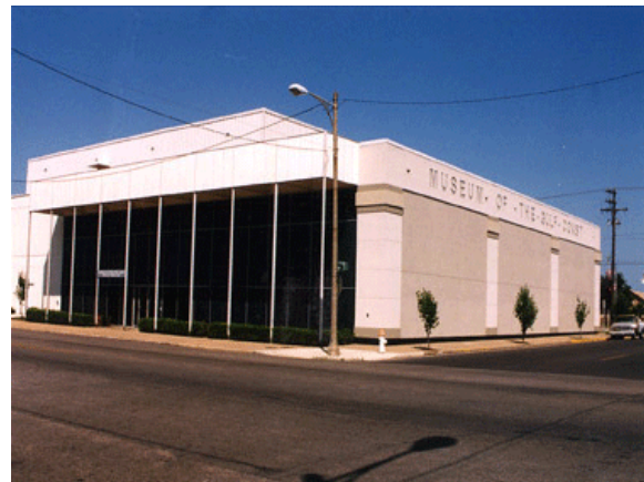
Museum of the Gulf Coast