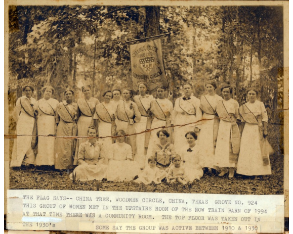
Chapter of China Tree, Woodmen Circle, China, Texas, Grove 924. Group was active between 1910 & 1930.