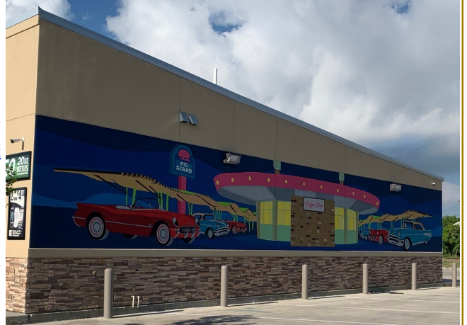
Mural Commemorating Pig Stand No. 41

Preservation Texas has issued their 2019 Most Endangered Places List which includes six listings from across the state. Beaumont's own Pig Stand No. 41 made the list in 2014. Sadly the building no longer stands on Calder Ave., but is commemorated in a mural painted on the side of the new building constructed on the site.