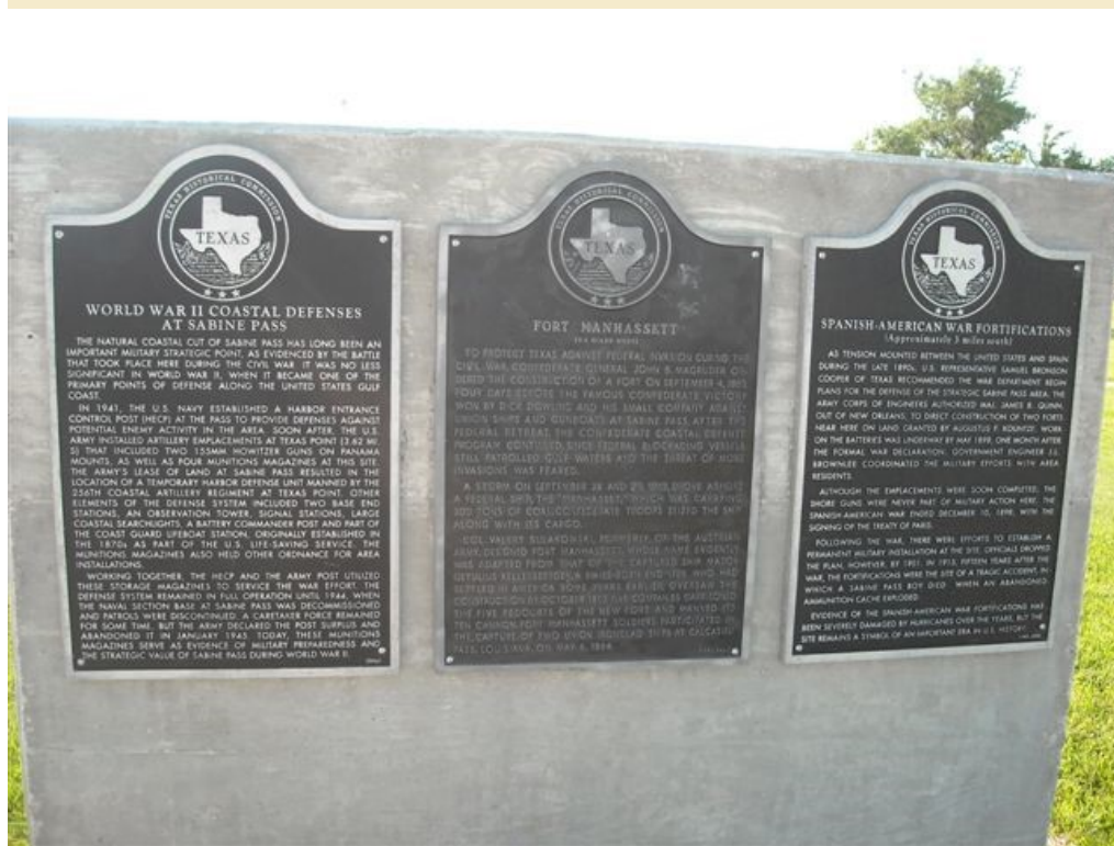
Texas Historical markers displayed at Sabine Pass Battleground that commemorate other important moments in the history of Sabine Pass

Credit: Texas Historical Commission website