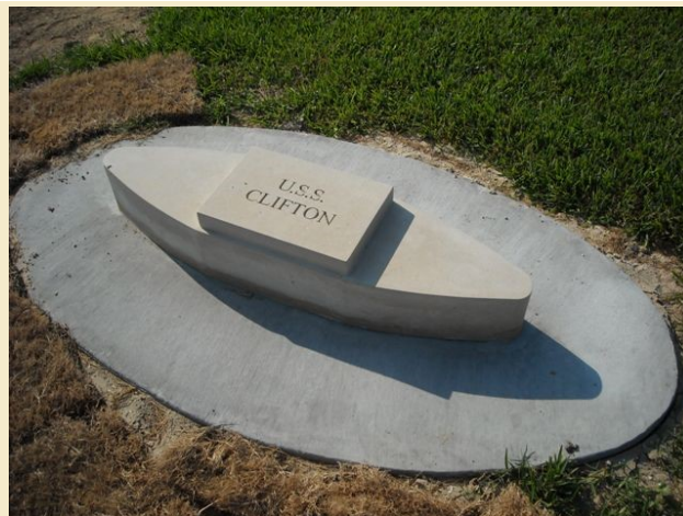
Representation of the USS Clifton at Sabine Pass Battleground Photo Credit: Theresa Goodness

Credit: Texas Historical Commission Historic Heights: State Historic Site Update 2019