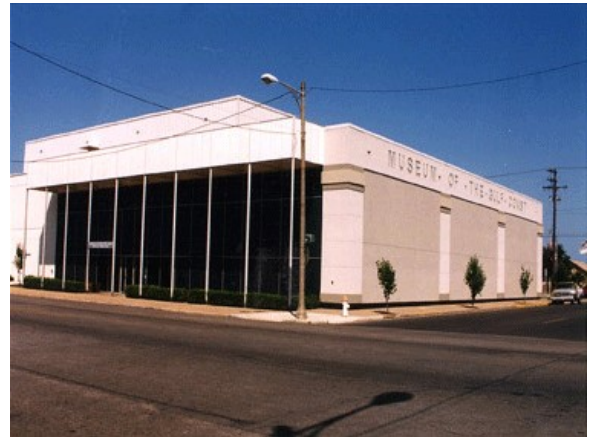
Museum of the Gulf Coast