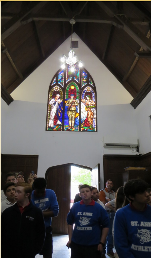
St. Anne Catholic School students touring the interior of the Temple to the Brave.

The Temple to the Brave was built by the Colonel George Moffett Chapter, Daughters of the American Revolution, as a memorial to those who died in World War I, and the building was dedicated on October 18, 1932.