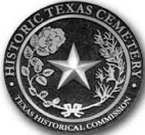
Historic Texas Cemetery Designation Seal

A workshop to view this training will be held in the Jefferson County Historical Commission's conference room on the third floor of the courthouse on May 23, 2019, at 10:00 a.m. The training is open to the public.