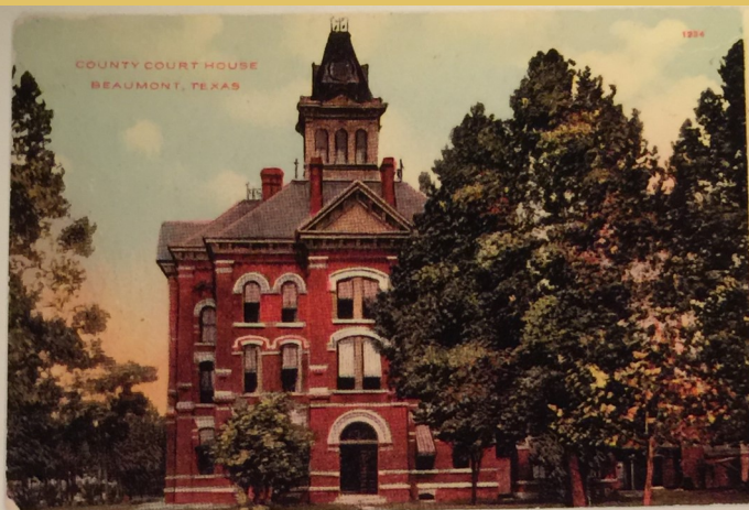
Postcard of the 1893 Jefferson County Courthouse