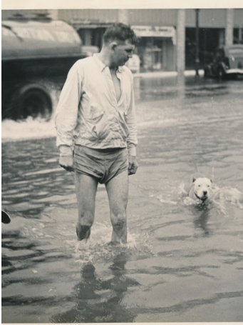
July 28, 1943 Flood in Port Arthur, 800 block of Procter

We're on the web! http://co.jefferson.tx.us/ Historical_Commission/