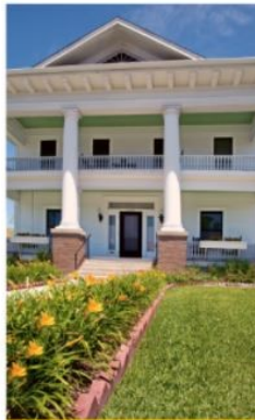
Heritage Happy Hour