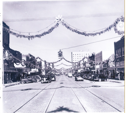
Procter Street in Port Arthur decorated for Christmas