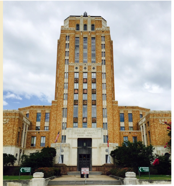
1931 Jefferson County Courthouse